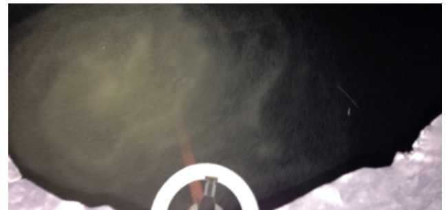
Proper collection and surface disinfection of nauplii is essential for controlling Vibrio loads that might enter production systems attached to nauplii