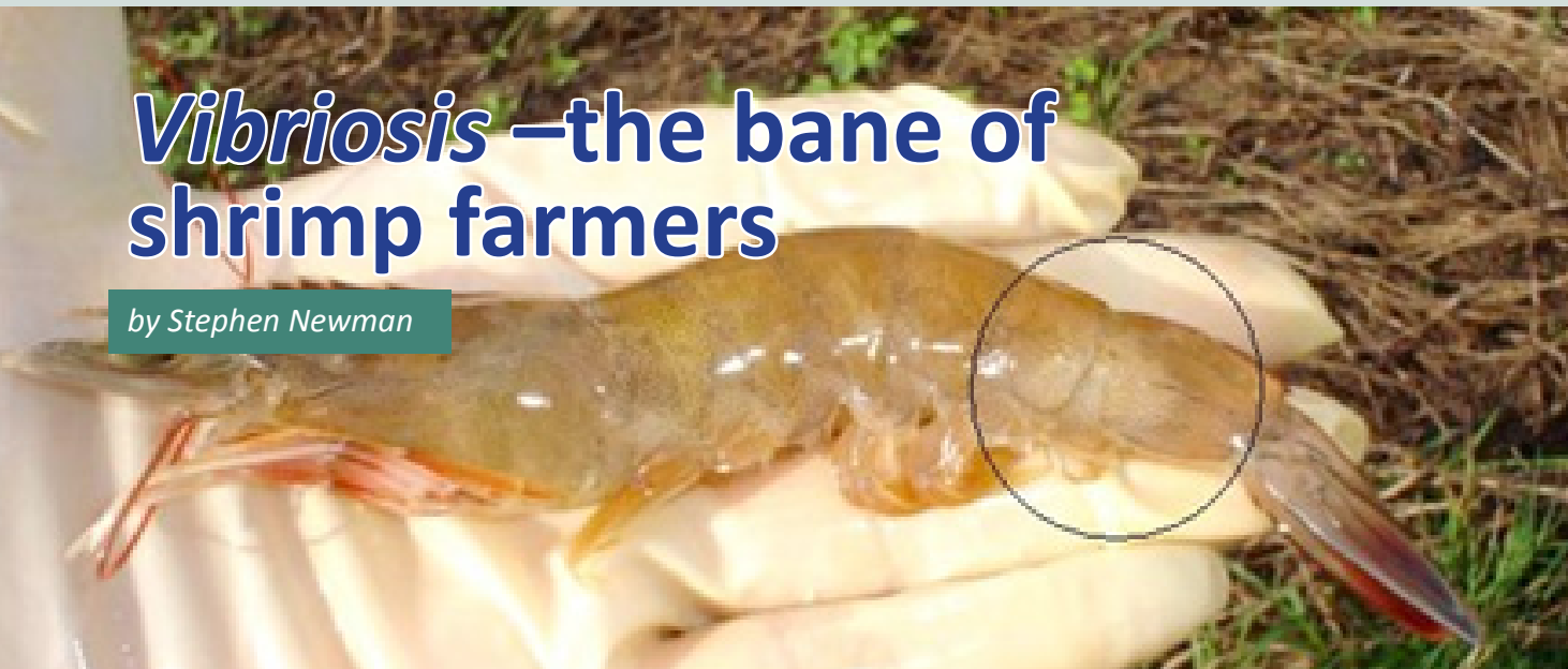
Dead muscle tissue in shrimp affected by an obligate pathogenic strain of Vibrio alginolyticus

Shrimp farmers throughout the world will be familiar with the challenges involved in preventing and dealing with diseases that could easily wipe out their stocks. Members of the Vibrio genus are foremost among the leading causes of mortality. Farmers need to understand that stress, genes and the environment play roles in susceptibility and that appropriate management strategies do not include automatically reaching for antibiotics.